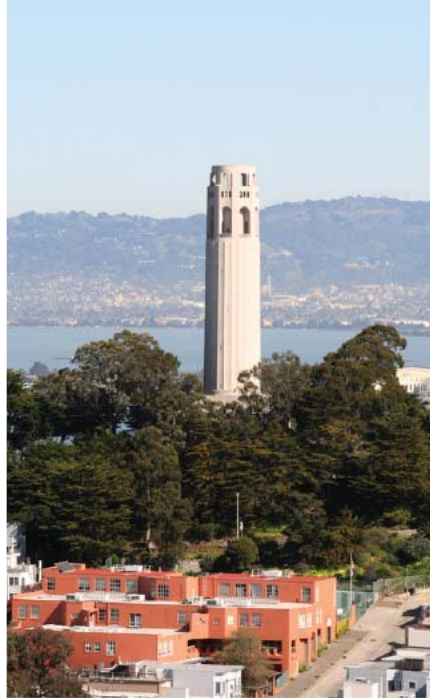
Coit Tower San Francisco, CA