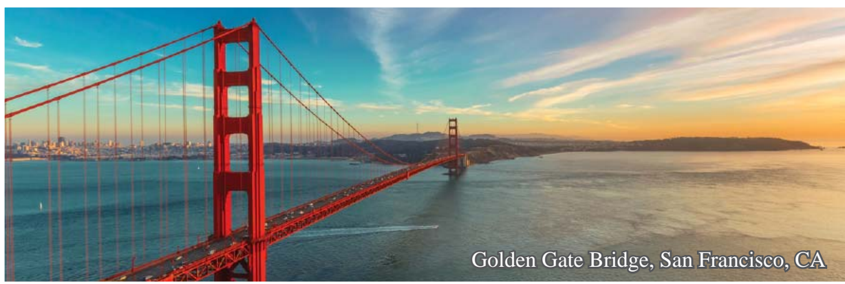
Golden Gate Bridge, San Francisco, CA